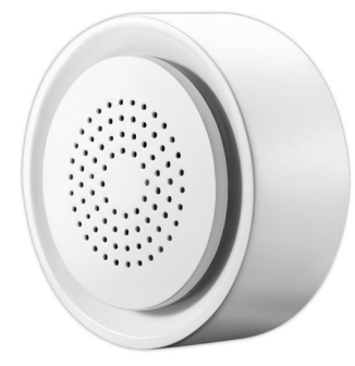
Siren & Chime